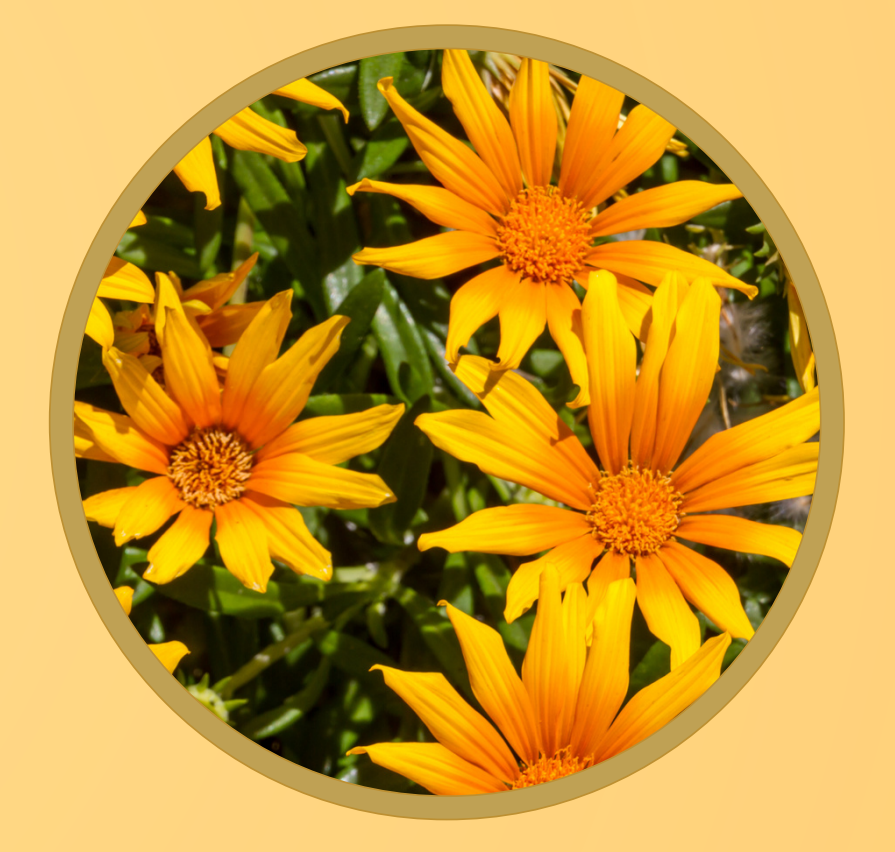
Surprise Speaker Look out for our announcement in early September!

Featuring six panels curated with parental insight. With six moderators guiding discussions and 18 panelists, expect a rich tapestry of perspectives and expertise.